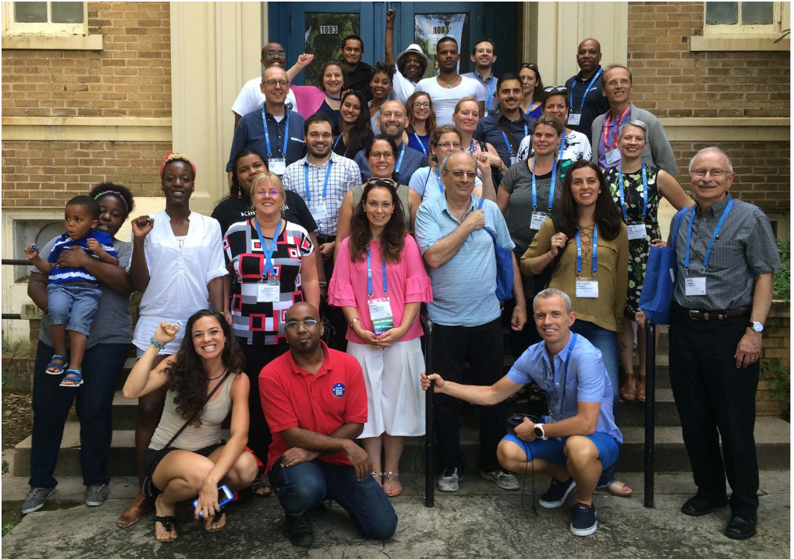
Farewells – organizers, activists and CMS participants

We now turn our focus to AOM 2018, and organizing GOOTH in Chicago. If you have any ideas, please feel free to share them with us.